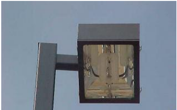
Pole Mount reflectors are perfected for peak quality...